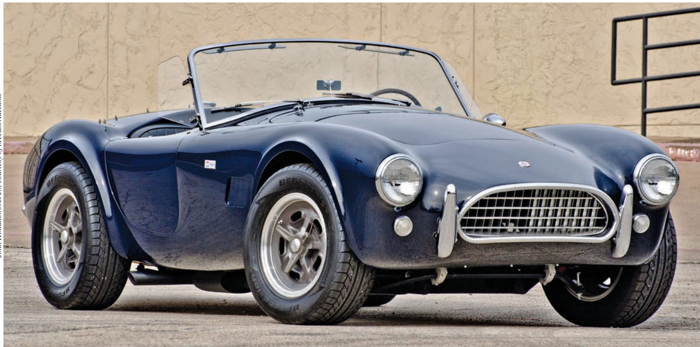
1963 Shelby 289, Mecum Lot S134

R ecently we witnessed the sale of two unique 289 Cobras — at two different auctions, within two months of each other. One was a modified street-specification car that has lived a quiet life in the United States.