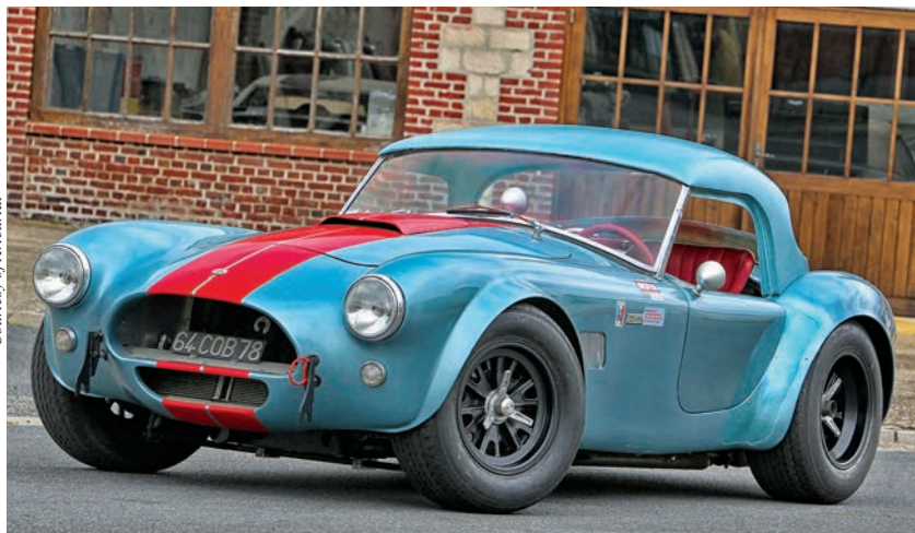
1964 AC Cobra, Artcurial Lot 240