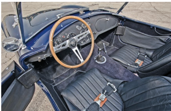
1963 Shelby 289, Mecum Lot S134

1961 AC Cobra Mk II Lot 541, s/n COB6034 Condition 1 Not sold at $312,500 Bonhams, Brooklands, U.K., 12/6/10 SCM# 168209