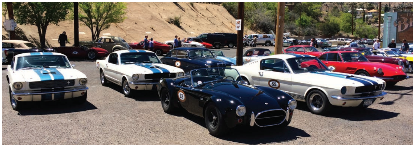
Only 22 of 86 cars entered this year were American, despite better parts availability and service support

THERE IS A RUMOR THAT MY COBRA SAW 6,600 RPM IN 4TH GEAR MORE THAN ONCE, BUT I CAN NEITHER CONFIRM NOR DENY THAT